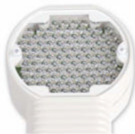
96 LED Array never needs replacement