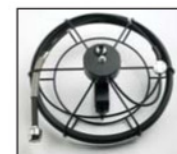
Camera probes with cable length greater than 3m will be coiled on a spool as shown on the left.