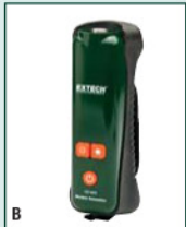
A. Articulating (6mm diameter) camera tip adjusts up to 320° viewing angle with four built-in bright LED lights illuminate dark areas B. HDV-WTX — Optional Wireless Transmitter transmits video to the main display from tight or hard to reach places up to 100ft (30m) away