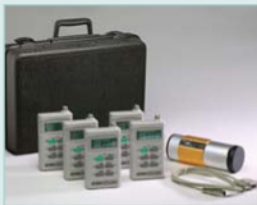
407355-KIT-5 Dosimeter Kit

Includes PC Windows® compatible software to maintain records and statistically analyze acquired data