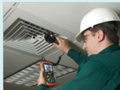
AN100 and AN200 used in HVAC applications measuring airflow from heating vents.