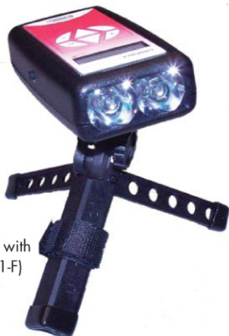
LabStrobe P/N STB100-F with optional Tripod (P/N TP1-F)