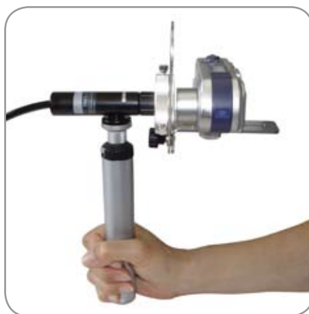
TMES with optional digital camera adaptor. Camera not included