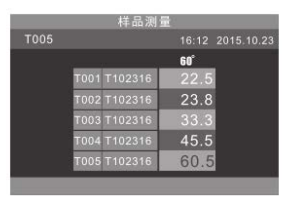
Figure 3 Single Angle Measurement

The instrument will enter the standby mode if without operation within five minutes. And it will turn off atomically if without operation within one minute in standby mode.