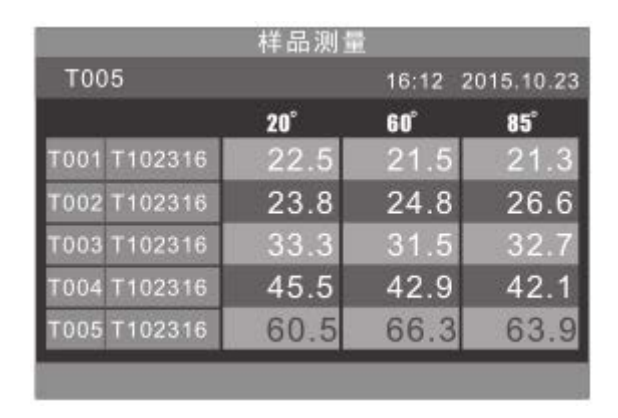
Figure 4 Multi-angle Measurement

"T102316" is a default name of measuring record. It is making up of "T"+"month"+"day", "T" means basic record, "102316" means the measuring record at16:00 pm on 23th October.