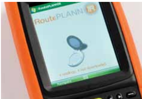
RoutePLANNIR™ database software