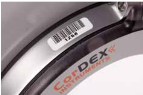
Unique IR Window identifiers using RFID, Barcodes and Serial Numbering